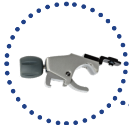
C-Clamp Bracket PN 190297-200