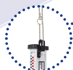
Pocket Chain With Trigger Snap for Limb Modules PN 067005-000