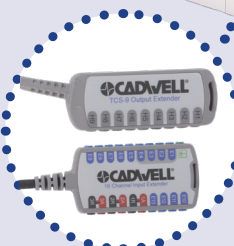
TCS-9 Output Extender PN 362068-000 16 Channel Input Extender PN 362071-000